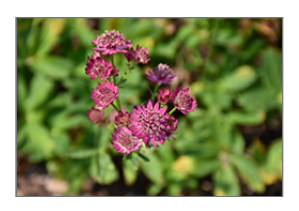
Venice Masterwort flowers