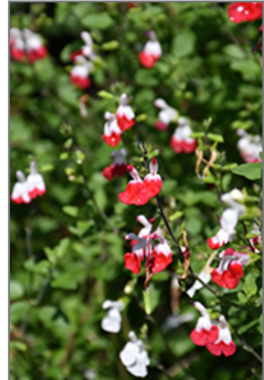
Hot Lips Sage flowers

Hot Lips Sage is a fine choice for the garden, but it is also a good selection for planting in outdoor pots and containers. With its upright habit of growth, it is best suited for use as a 'thriller' in the 'spiller-thriller-filler' container combination; plant it near the center of the pot, surrounded by smaller plants and those that spill over the edges. It is even sizeable enough that it can be grown alone in a suitable container. Note that when growing plants in outdoor containers and baskets, they may require more frequent waterings than they would in the yard or garden. Be aware that in our climate, this plant may be too tender to survive the winter if left outdoors in a container. Contact our experts for more information on how to protect it over the winter months.