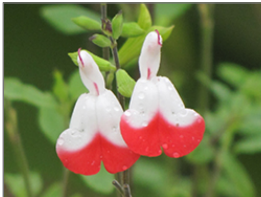
Hot Lips Sage flowers

Hot Lips Sage is an herbaceous evergreen perennial with an upright spreading habit of growth. Its relatively fine texture sets it apart from other garden plants with less refined foliage.