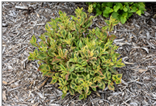
Rainbow Sensation Weigela

Rainbow Sensation Weigela makes a fine choice for the outdoor landscape, but it is also well-suited for use in outdoor pots and containers. Because of its height, it is often used as a 'thriller' in the 'spiller-thriller-filler' container combination; plant it near the center of the pot, surrounded by smaller plants and those that spill over the edges. It is even sizeable enough that it can be grown alone in a suitable container. Note that when grown in a container, it may not perform exactly as indicated on the tag - this is to be expected. Also note that when growing plants in outdoor containers and baskets, they may require more frequent waterings than they would in the yard or garden.