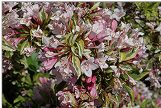
Rainbow Sensation Weigela flowers

Rainbow Sensation Weigela is recommended for the following landscape applications;